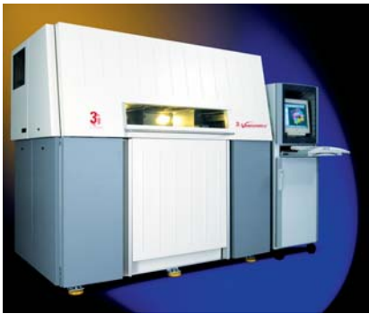
3D Systems' Vanguard SLS system

Create durable, high-quality fully testable nylon thermoplastic parts for functional testing with Accura DuraForm material and an SLS system - from 3D Systems