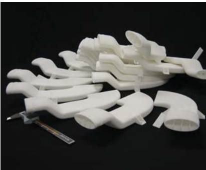
Build functional parts - quickly, easily and with minimal labor.

DuraForm™ polyamide (PA) and DuraForm glass-filled (GF) nylon materials are part of the growing family of Accura® LS (laser sintering) materials developed specifically for use in 3D Systems' SLS® (selective laser sintering) systems. These two DuraForm materials produce rugged engineering thermoplastic parts that withstand aggressive functional testing.